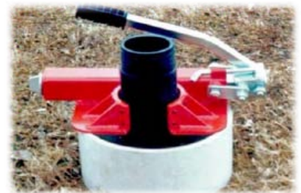
J&K KWIK KLAMPS 1"-2" and 2-1/2"-4"