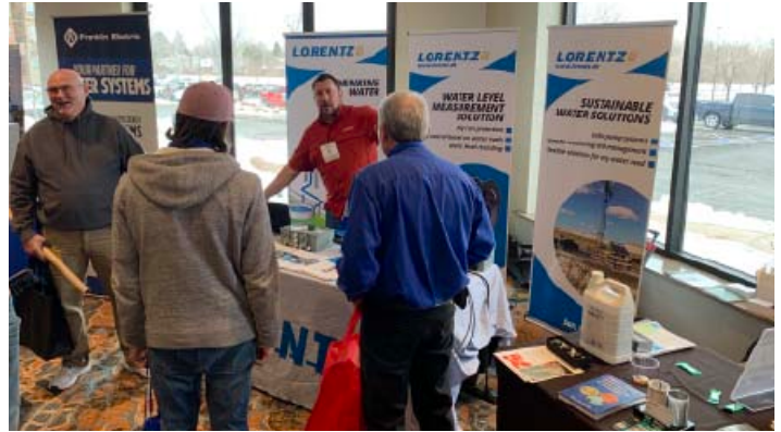
Lorentz US Corp