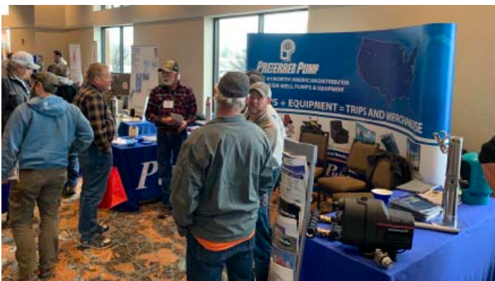
Preferred Pump Equipment