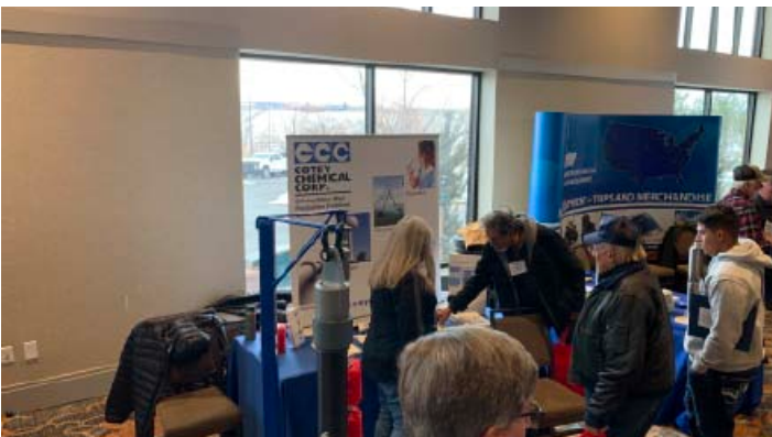
Cotey Chemical Corporation