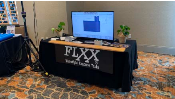
Front Range Precast Concrete, Inc