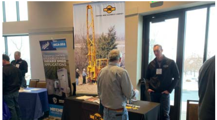
Central Mine Equipment Company