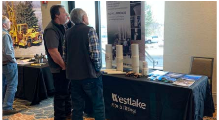
Westlake Pipe And Fittings