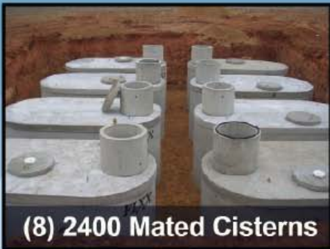
(8) 2400 Mated Cisterns

Front Range Precast Concrete manufactures custom water storage tanks in a variety of sizes for many applications including Water Cistern, Fire Protection Water Storage, Irrigation cisterns