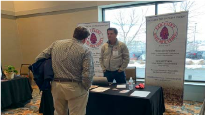
Red Flint Sand & Gravel