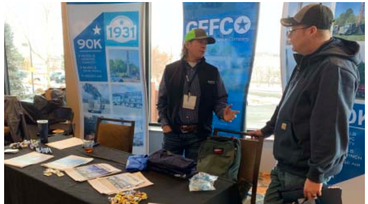
GEFCO / BAUER Equipment America