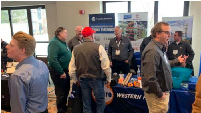
Western Hydro Corporation