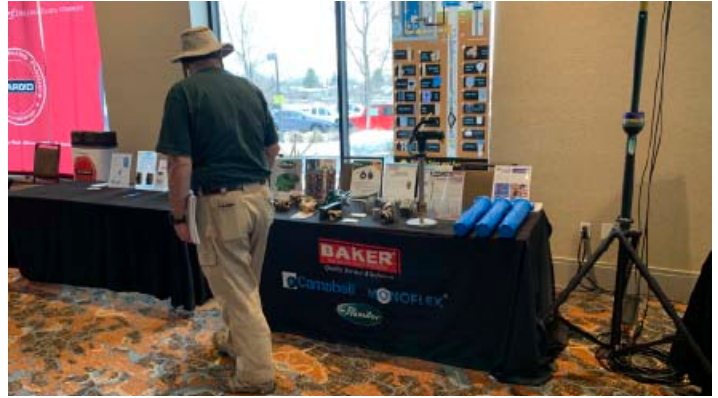
Baker Manufacturing Co, LLC Baker Water Systems