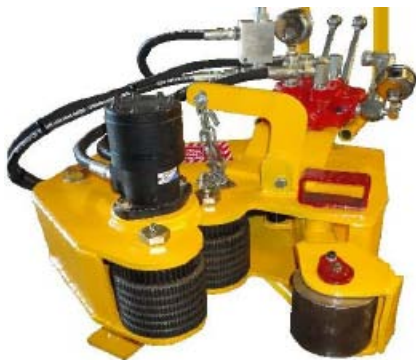
HYDRORENCH S14H, S110H, S112H

We have 11 different sizes for your well working needs. Personal or Company Use, Residential and Commerical.