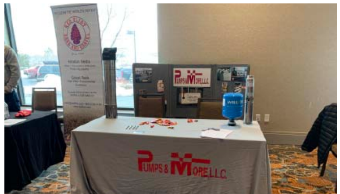
Pumps & More, LLC