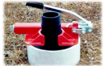
J&K KWIK KLAMPS 1"-2" and 2-1/2"-4"