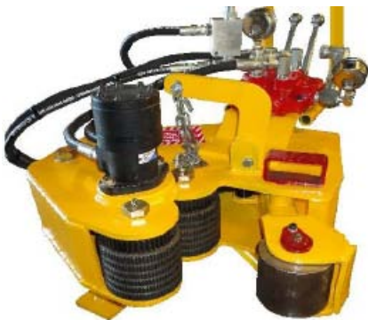
HYDRORENCH S14H, S110H, S112H

We have 11 different sizes for your well working needs. Personal or Company Use, Residential and Commerical.