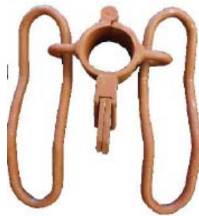
PIPE ELEVATORS Standard 1"-6" Heavy Duty 6"-16"