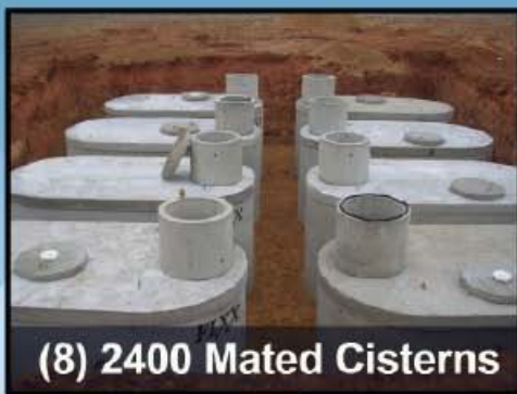
(8) 2400 Mated Cisterns

Front Range Precast Concrete manufactures custom water storage tanks in a variety of sizes for many applications including Water Cistern, Fire Protection Water Storage, Irrigation cisterns